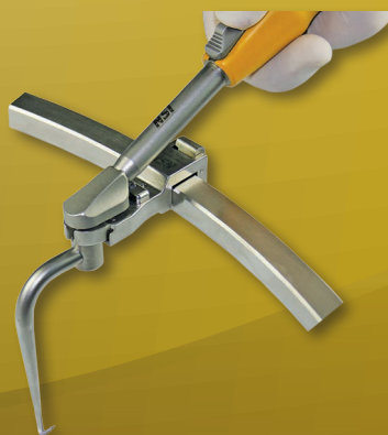
Clear-Line L offers "Gelpi" hook options