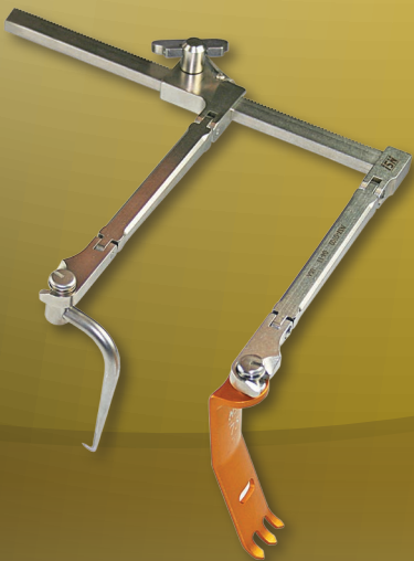
Micro Dissectomy capability