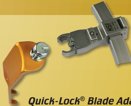
Quick-Lock® Blade Adapter • Quick / Simple blade attachment