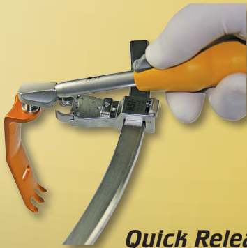
Quick Release Handle • Aligns blade – for fast / easy fixation to frame