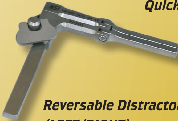
Reversible Distractor (LEFT/RIGHT)